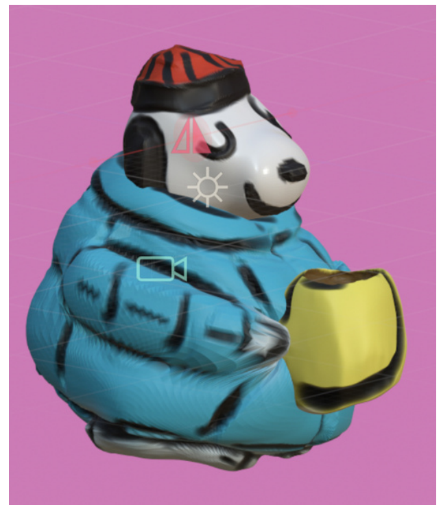
SCULPT IN NOMAD